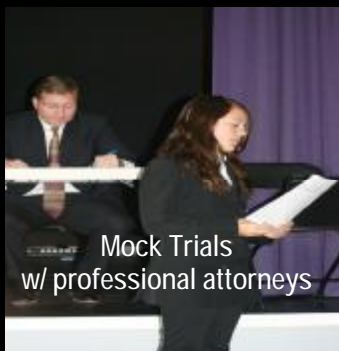
Mock Trials w/ professional attorneys

Multiple Intelligence is a cognitive theory that states that each individual has varying levels of intelligences and thus each student uses a unique “cognitive profile” to learn. Dream Middle School (DMS) presents challenging academics in a variety of ways (intelligences) ensuring that learning is relevant to every student. DMS students learn to customize all information to match their personal cognitive profile. Dream Middle School students know who they are and how they learn. DMS students will succeed in high school college, and more importantly life.